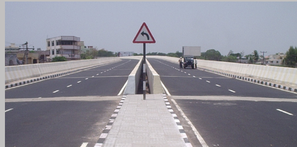
Ongole Flyover approach